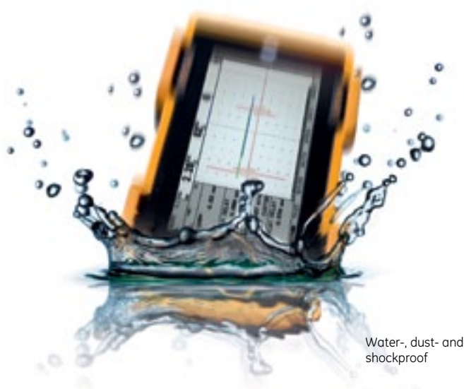
Water-, dust- and shockproof