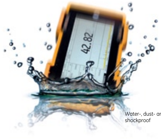
Water-, dust- and shockproof