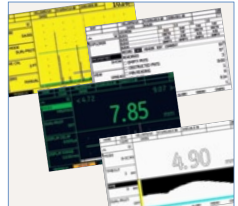
Views to suite everyone: large A-Scan, Data Recorder, thickness, B-Scan.