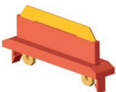
50A / 100A Collector Shoe and Holder 310993