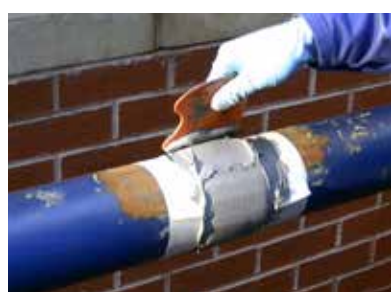
Belzona layer of Belzona 1212 applied