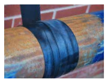
Belzona 9611 and tourniquet