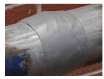
Leak repair completed

For more information, please contact your local Belzona representative: