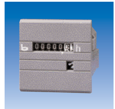
type 631.2, 631.3, 633.2, 633.3, 629.2, 629.3, 637.2, 637.3