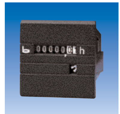
type 632.2, 632.3, 634.2, 634.3, 630.2, 630.3, 638.2, 638.3