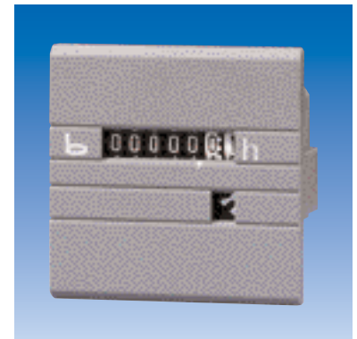
type 631, 631.1, 633, 633.1, 629, 629.1, 637, 637.1