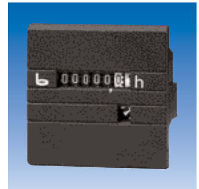
type 632, 632.1, 634, 634.1, 630, 630.1, 638, 638.1